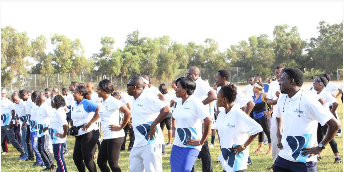
A cross section of participants during a work out session at the Trustfund/Pro Health 'Walk for Life' in Abuja.